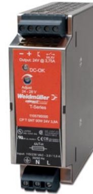
CP T SNT 90W 24V 3.8A