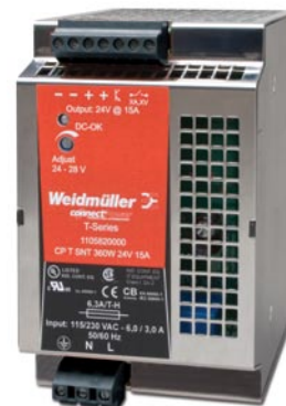
CP T SNT 360W 24V 15A

Weidmüller, Canada 10 Spy Court Markham, Ontario L3R 5H6 Telephone: (800) 268-4080 Facsimile: (877) 300-5635 Email: info1@weidmuller.ca Website: www.weidmuller.ca