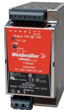
CP T SNT 180W 24V 7.5A